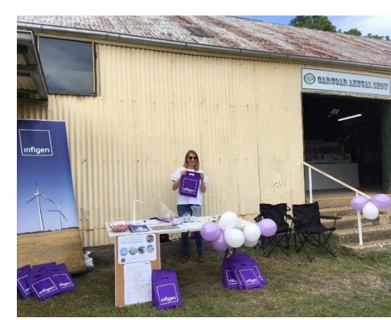
Infigen was pleased to sponsor part of the Carcoar Annual Show in October 2017.